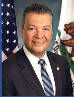
Alex Padilla U.S. Senator