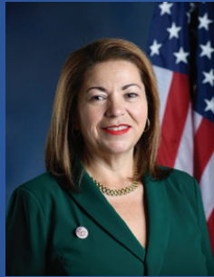
Linda T. Sánchez Representative CA-38