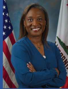
Laphonza Butler U.S. Senator