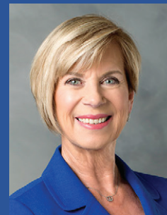
Janice Hahn LA County Board Supervisor District 4