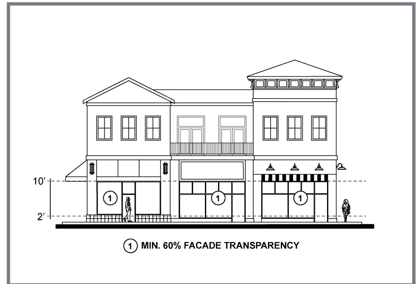
Example: Design and Articulation