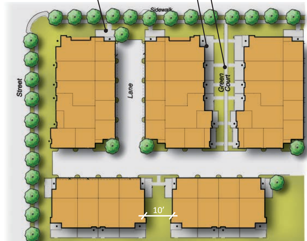
Example: Site Design and Building Envelope