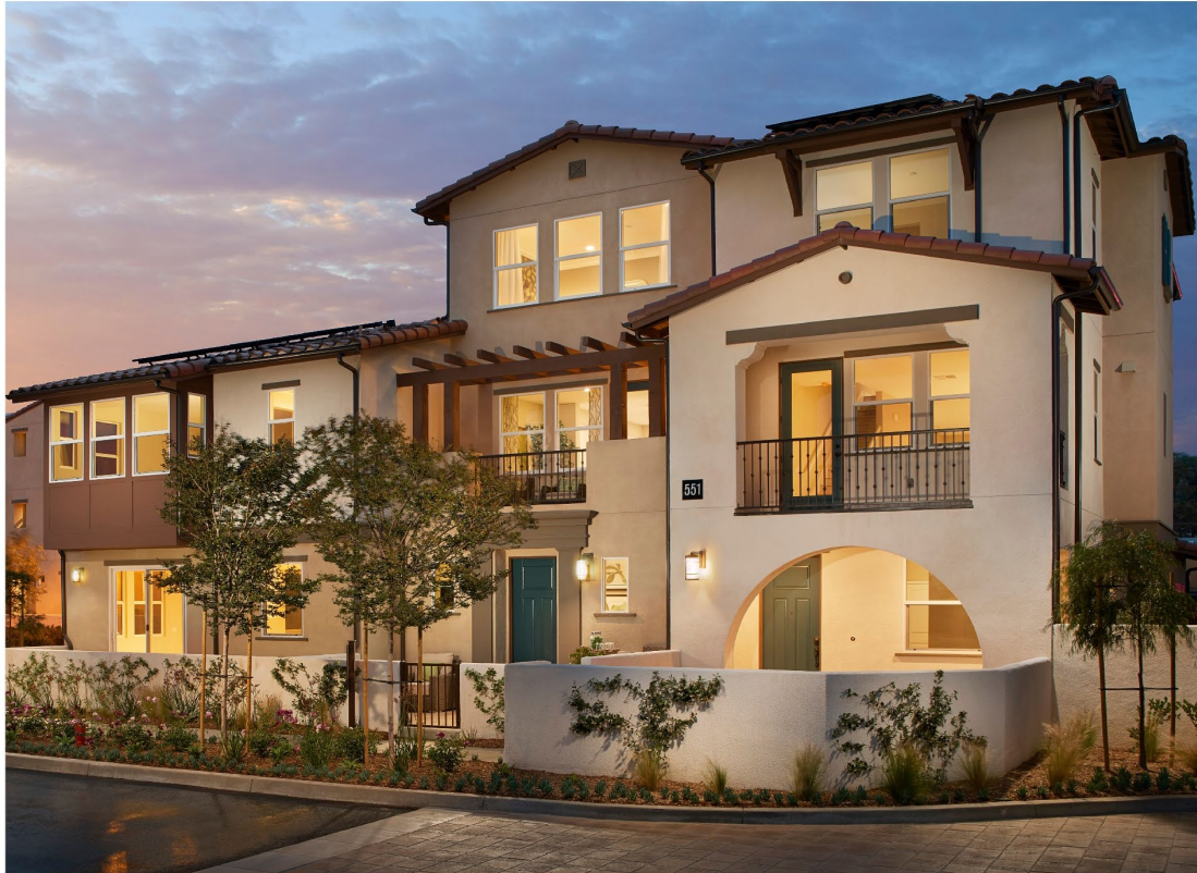
Example: Architectural Style