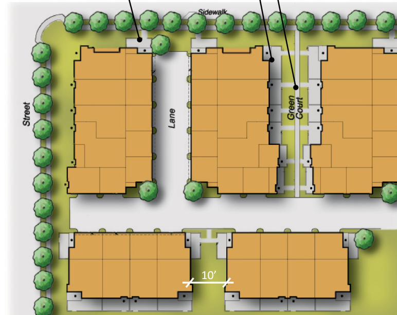
Example: Site Design and Building Envelope

Public view into green court Private open space with front access opening to green court Front doors connecting to sidewalks