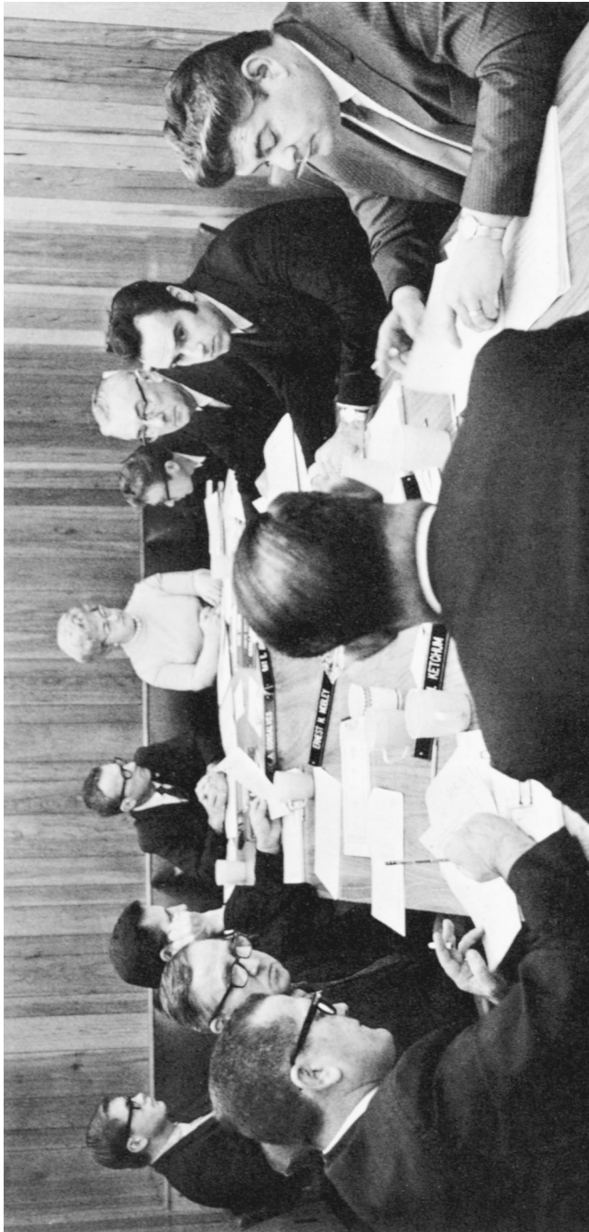
An Assembly Rules Committee Meeting During 1969 Session