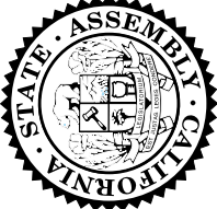
THE CALIFORNIA LEGISLATURE ASSEMBLY RULES COMMITTEE

Although the procedure can become more complicated, this chart shows the essential steps for passage of a bill. Typical committee actions are used to simply clarify the course of legislation.