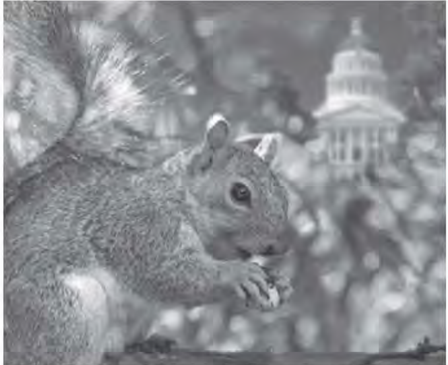
Capitol Park in Sacramento is popular with squirrels as well as legislators, lobbyists and locally elected officials.

Special session urgency bills require a two-thirds vote for passage. If signed by the governor, such bills go into effect immediately upon signature. Non-urgency special session bills, which require a majority vote for passage, go into effect on