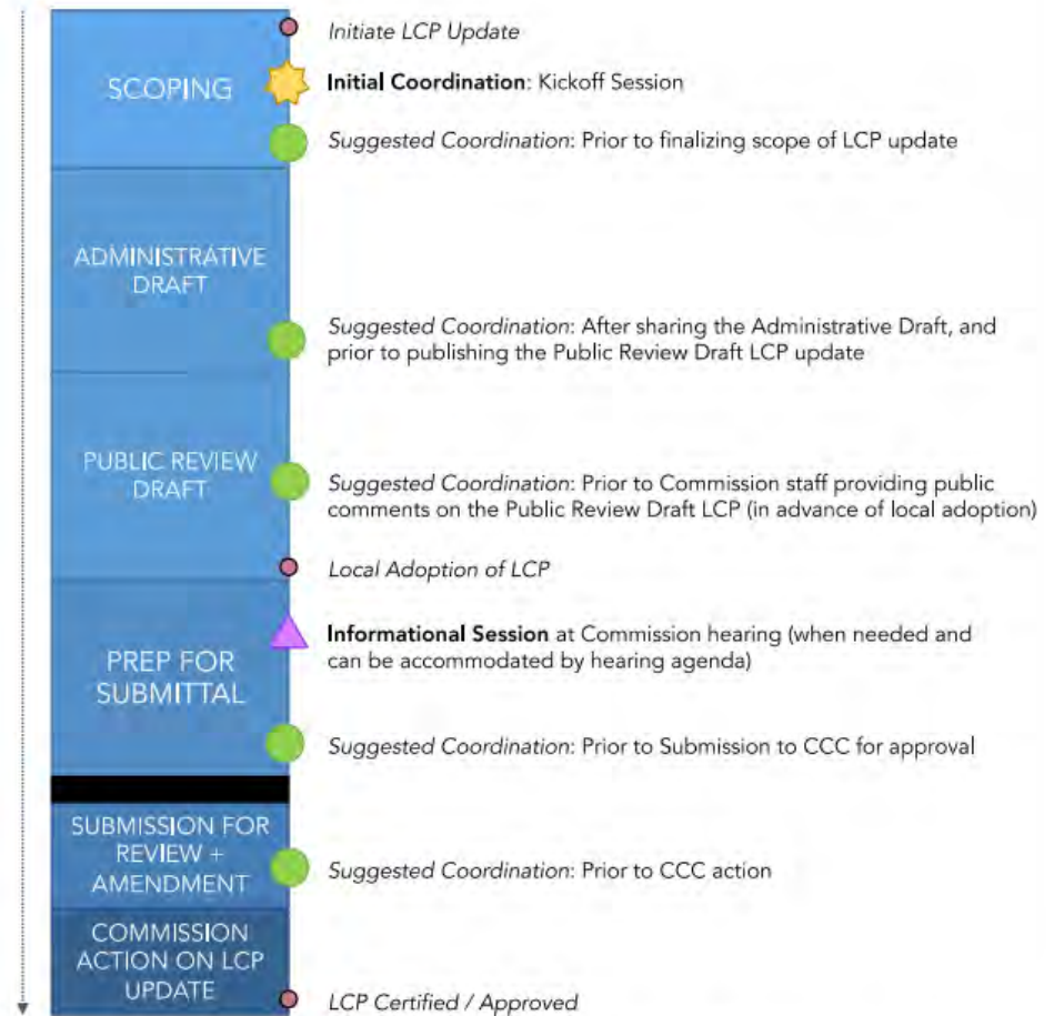
Figure 1. Suggested milestones for coordination between jurisdictions and the Commission for all LCP updates.

*Coordination/ elevation can be initiated at any point should an LCP update process encounter unexpected challenges.