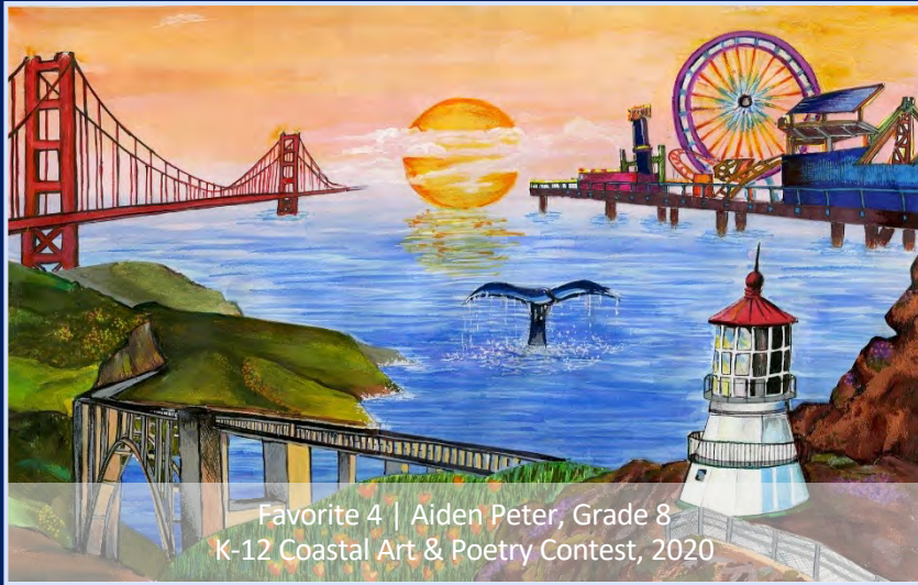
Favorite 4 | Aiden Peter, Grade 8 K-12 Coastal Art & Poetry Contest, 2020