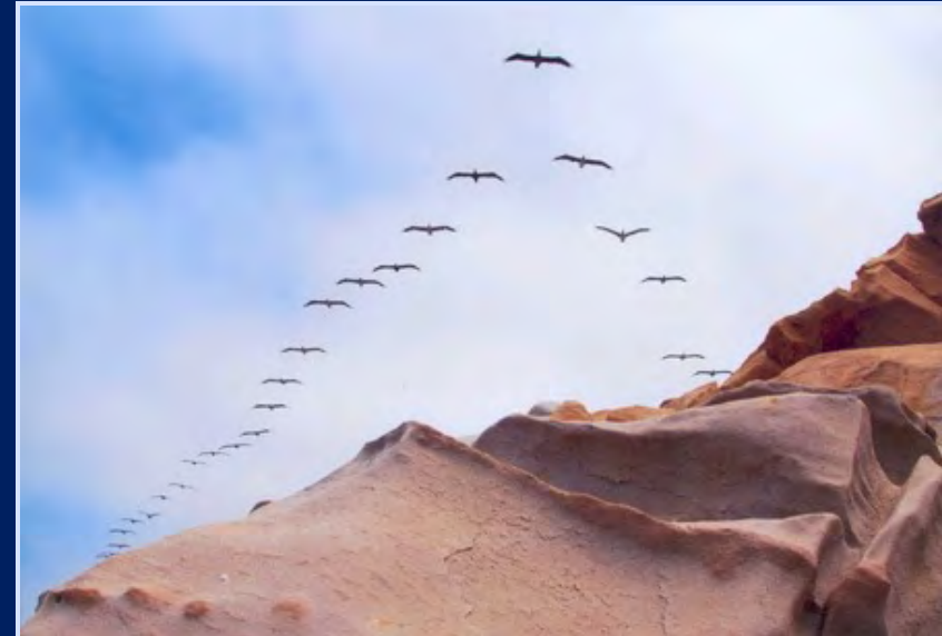
Pelican Salute | Marcia Rhoades CA Ocean & Coastal Amateur Photography Contest, 2010