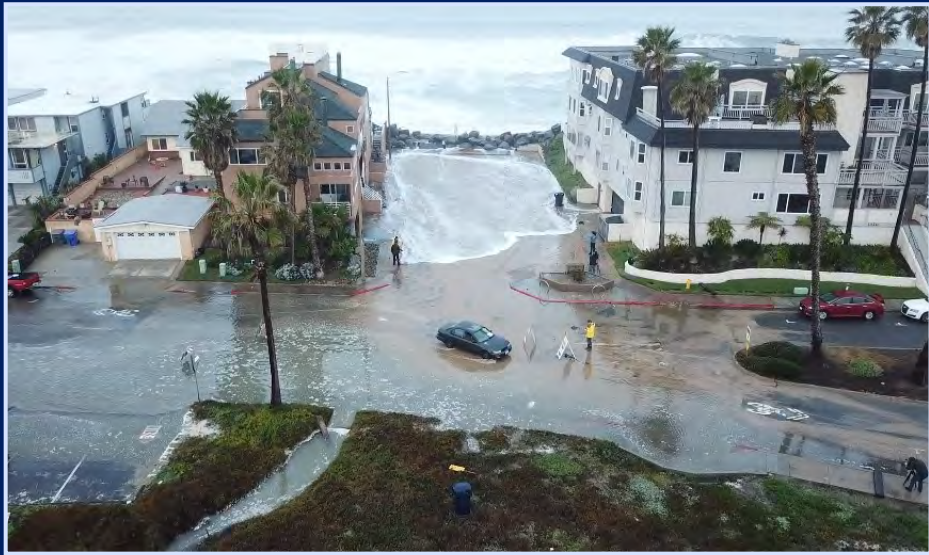
Imperial Beach, San Diego Co. | Scripps Inst. of Oceanography