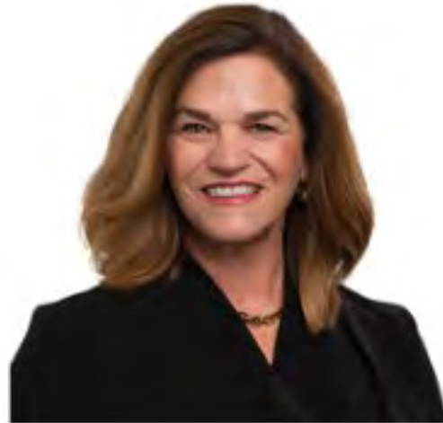
Patricia Lock- Dawson Mayor, City of Riverside