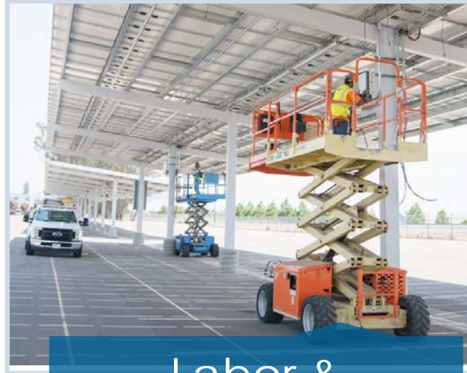
Labor & Construction